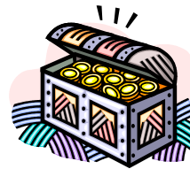
Treasure & Trivia

Please, sign up on the bulletin board just outside of Whitlock Hall.